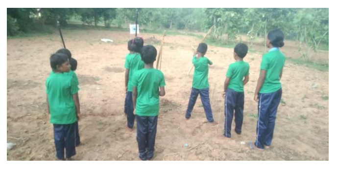
Students of Archary training academy with uniforms provided by us.

dug for the purpose. Cost of digging these two ponds was about Rs. 7 lakhs.